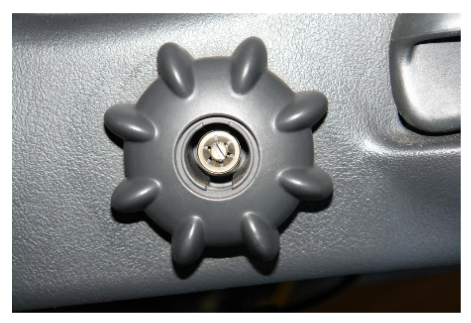
It IS possible to open these up with a small screwdriver and then pull off, but you may need to buy new ones for refitting.

The recline control is held on with a Starlock thingy, accessed by removing the cover: