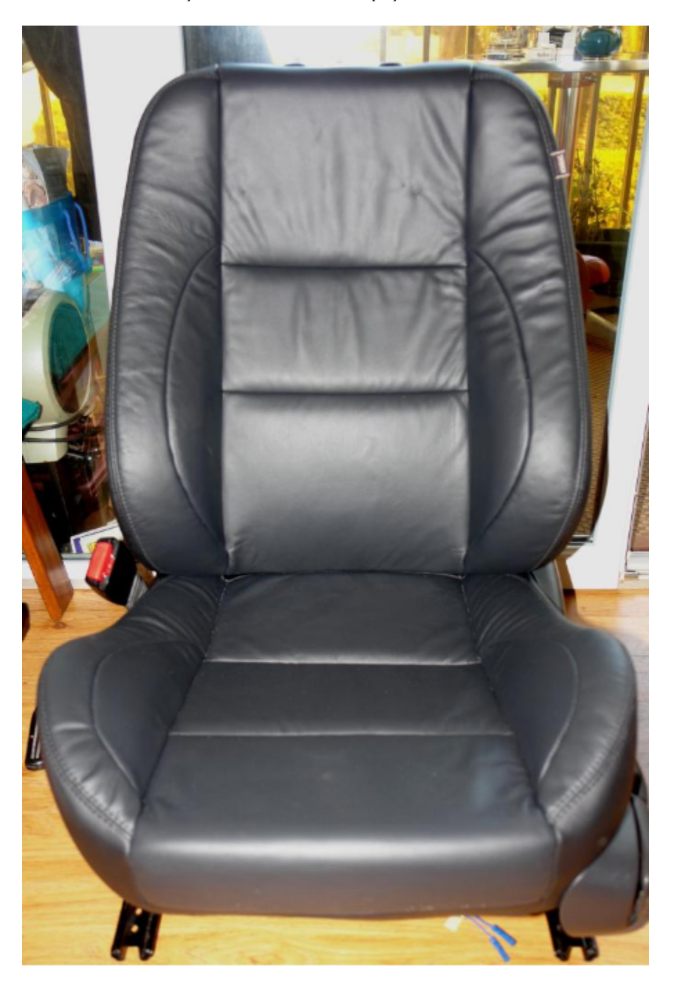
And if it all works out, you have one of these to play with