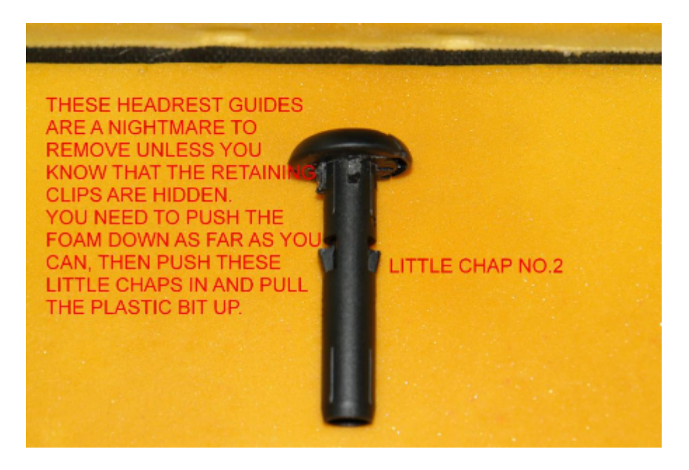
OK, you did that without breaking anything.

You need to remove the two very classy looking bits of plastic. This is not easy unless you know exactly how they are fitted: