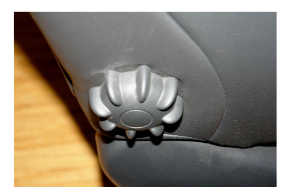
Don't try to remove the cap because it isn't a cap!

The lumber control on mine had to be pulled off - USING A LOT OF EFFORT, there was no special fixing.