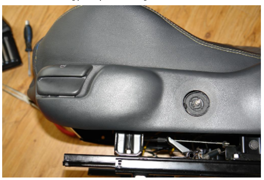
Recline the backrest FULLY and remove the two torx screws shown:

Now remove the long plastic piece covering the controls.