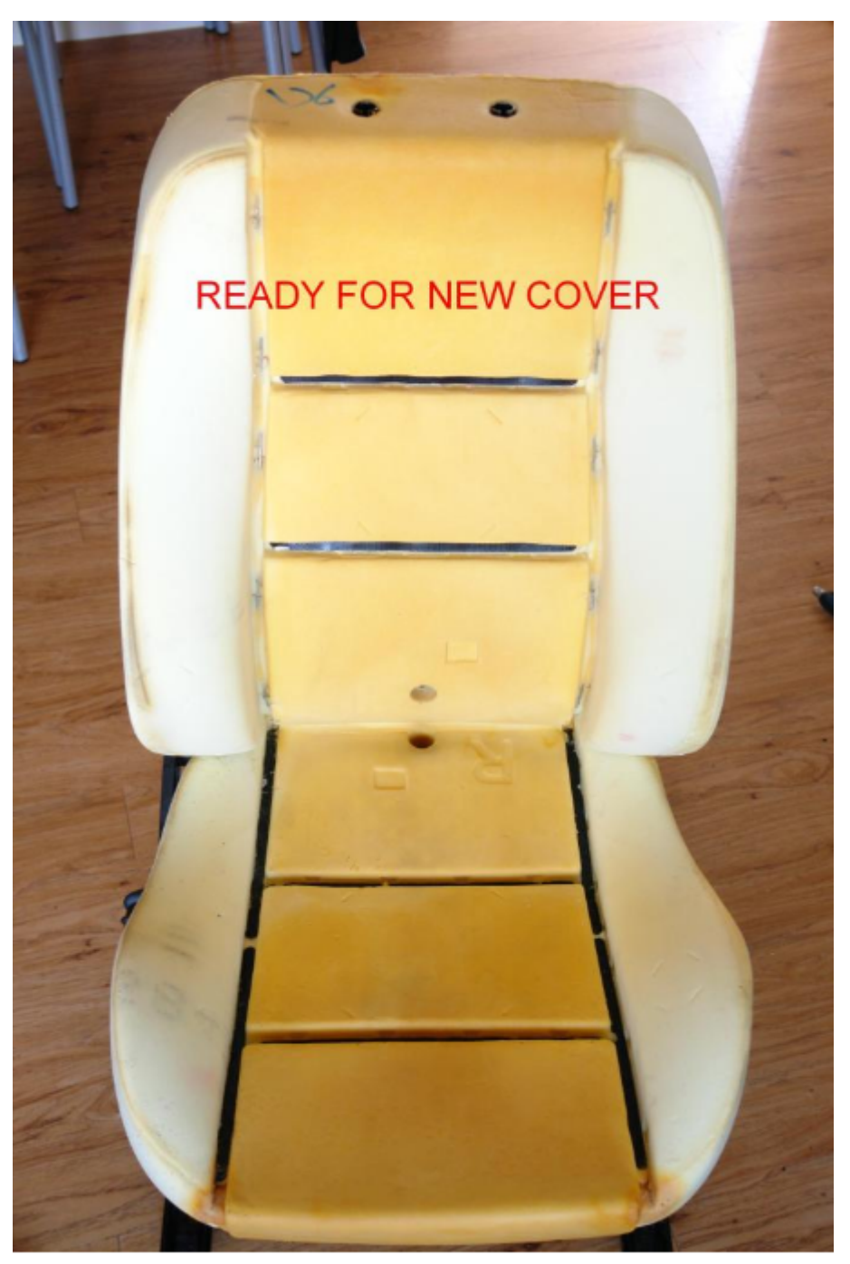
In the famous words of MR Haynes, "assembly is a reverse of the above". A bit over simplified perhaps, but you get the picture.

You should now have something that looks a bit like this: